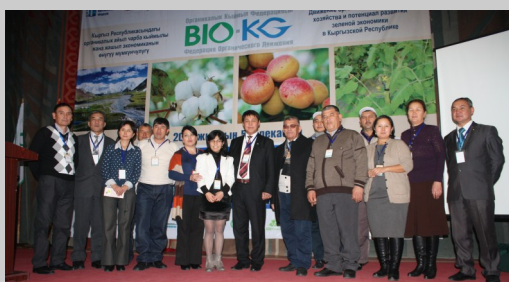
First National Organic Forum Bishkek, December/2012

To strengthen our organic value chains and get experience from well experienced western partners BCP Manager, BioService and BioFarmer Chief Directors and successful farmer leader representing Kyrgyz organic interests from our side visited Bio-Fach, the biggest world organic trade fair, where organic people meet. Our team strengthen partnership with existing buyers and established new relations with potential stakeholders.