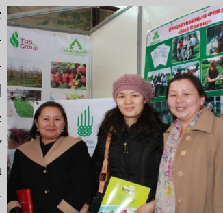
New staff at AgroExpo Fair, February/2013

For today, the Biocotton project has reached its consolidation phase, which focuses on strengthening capacities of partner organizations and creating a conducive environment for organic farming in Kyrgyzstan. We are looking forward for the days when organic farming becomes attractive to farmers as well as to state authori-