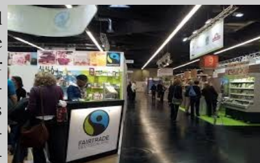
Visiting BioFach Nuremberg, February/2013