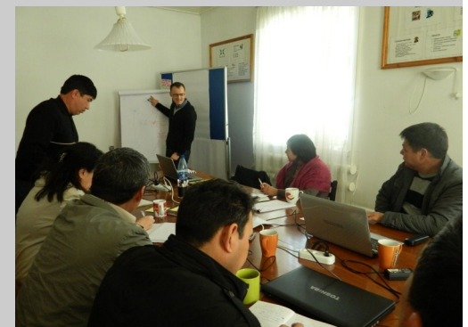
The discussion on co-existence management of organic and GMO, March/2013

One of the most unwanted enemies of organic is GMO (genetically modified organism), whose genetic material has been altered using genetic engineering techniques. GMOs include micro-organisms such as bacteria and yeast, insects, plants, fish, and mammals. Organic principles consider that the use of GMOs de-emphasizes biodiversity and is an unnatural addition to the gene pool of cultivated crops, animals and micro-organisms living on farms.