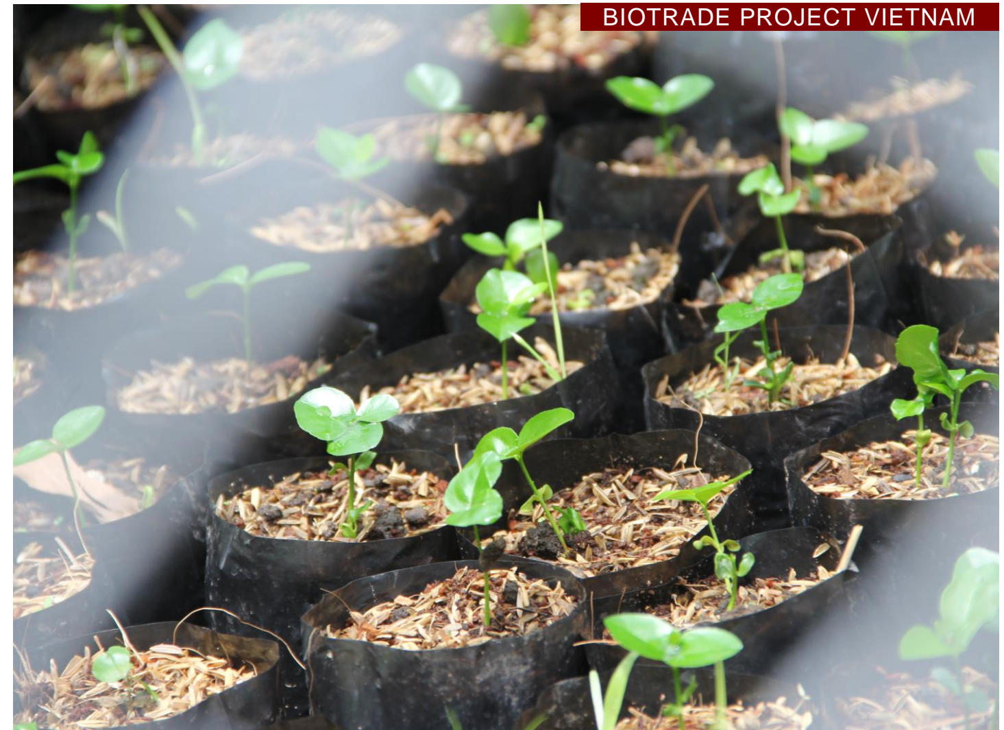
BIOTRADE PROJECT VIETNAM