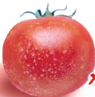
■ Treatment residues