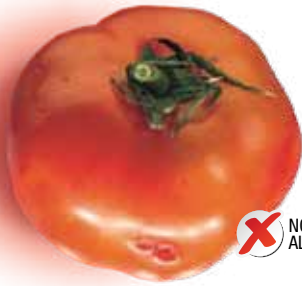
■ Damaged tomato