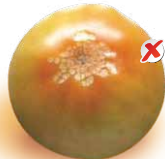
■ Damage by snails