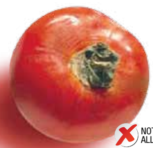
■ Signs of rotting