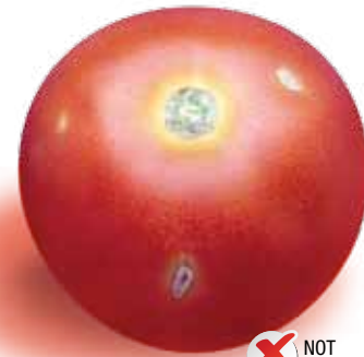
■ Unhealed damage caused by hail