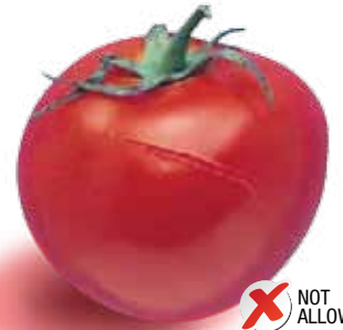
■ Fresh cracks