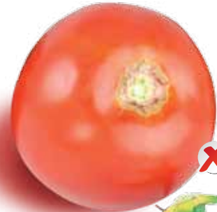
■ No stalk