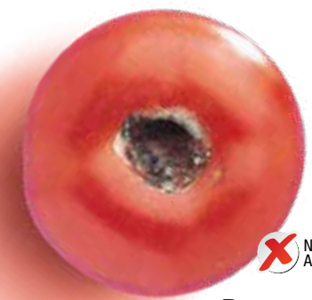
■ Damage by insects