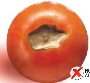
■ Blossom-end rot