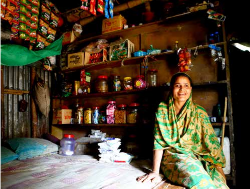
Home doubles as a small grocery shop in Bangladesh

Swiss Agency for Development and Cooperation SDC