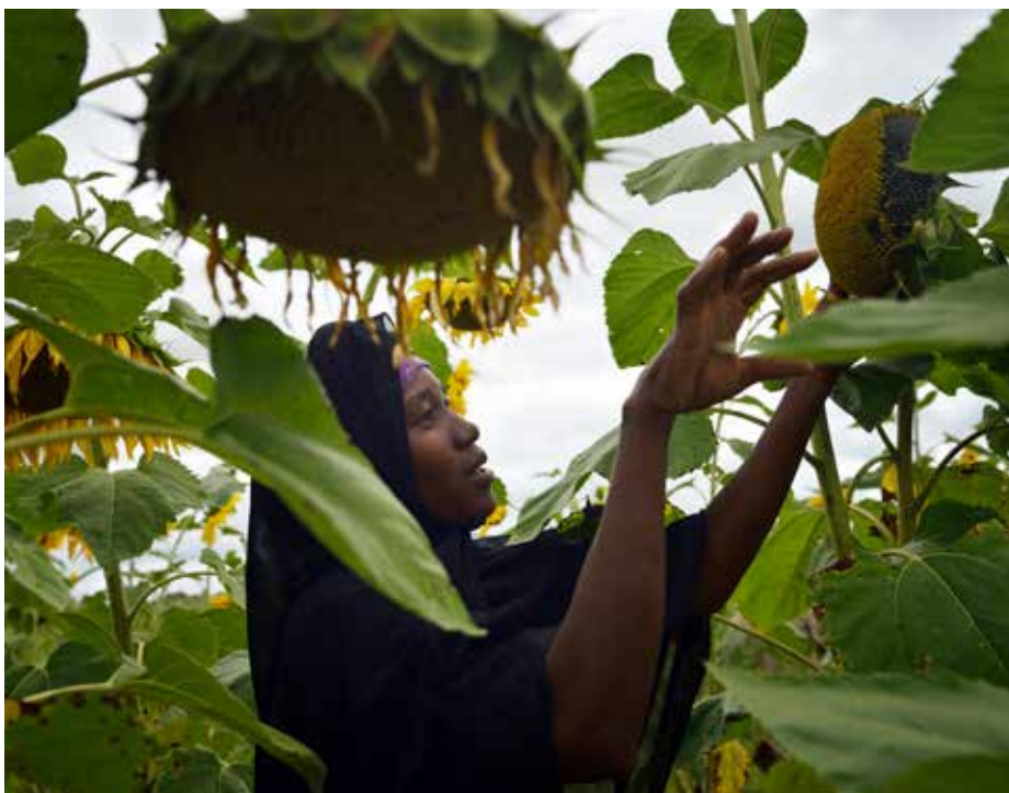
A woman contract farmer in Tanzania assesses the sunflower harvest