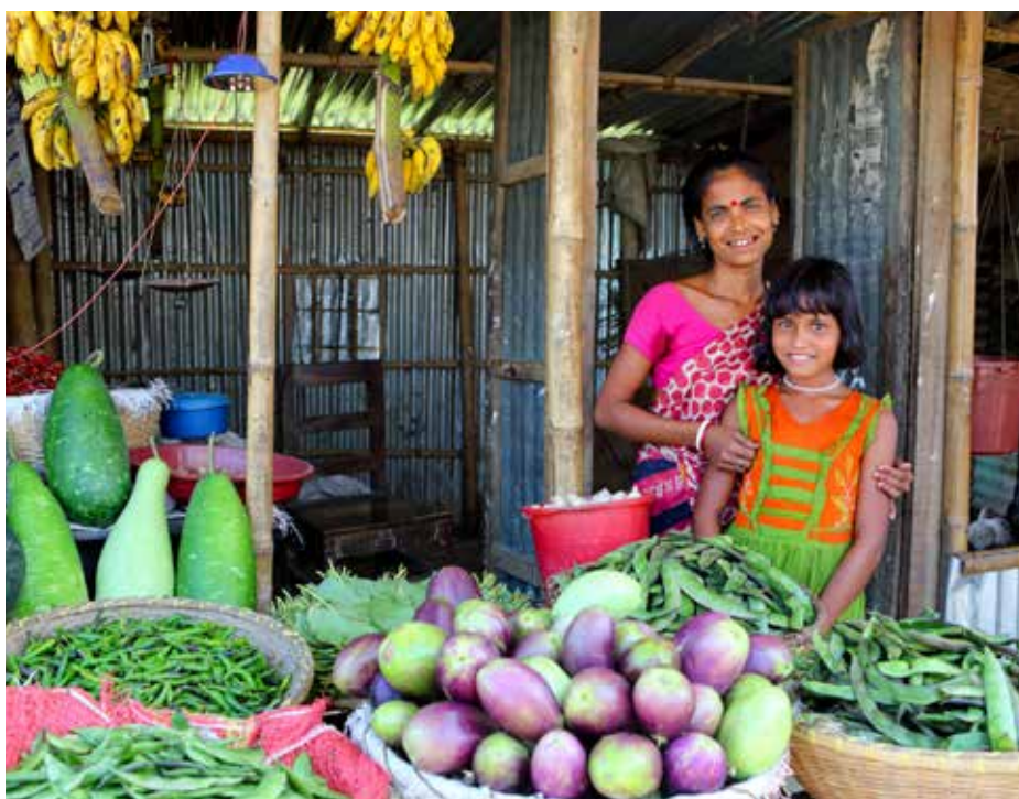
A vegetable shop provides a valued source of income for a mother and daughter in Bangladesh

points of women, and identifying key constraints and opportunities for both men and women. They then selected gender-related activities in the chili, maize and jute sub-sectors. The team also found that women on the mainland were already working as paid labourers in the handicraft sub-sector, but not on the chars. This type of paid labour was found to be more socially acceptable (by both women and men) than agricultural work. Thus, the team looked for ways to promote skills development and market linkages through handicraft companies, creating new employment opportunities for women on the chars.