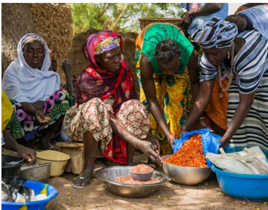
Women in Mali gather under a shady tree to sell their farm products

municipal budgets for kindergartens which in turn provided women with more time for productive work such as looking after small livestock. All other interventions specifically target both men and women (i.e. gender is mainstreamed).