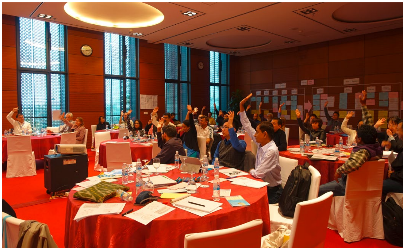
Endorsement of the Hanoi Statement, March 2015, Vietnam