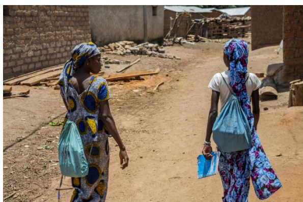
The project will help children and youth on the move increase access to education and other safeguard protections.

The Enfants et Jeunes Migrants (EJM) project aims to strengthen national and regional systems of protection, education and socio-economic inclusion in a sustainable manner to facilitate access to the services provided by these systems for children and youth on the move. For the first phase, the project will be implemented in five pilot countries: Tunisia, Morocco, Niger, Mali and Guinea. Helvetas will lead the project consortium with support from Terre des Hommes and GIZ International Services and other implementing partners. The project is expected to be expanded in phase II and III (2025 – 2032) to the entire ECOWAS region plus Mauritania and all of North Africa, including Algeria and Libya.