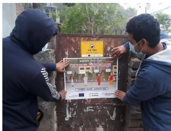
A youth-led street campaign on COVID-19 awareness.

The CSO PVE Capacity Building project is a multi-country civil society initiative that explores methods for preventing violent extremism (PVE) in diverse contexts and identifies drivers and common narratives of extremism in Bangladesh and Sri Lanka. The project engages youth and youth leaders to support PVE initiatives led by civil society organizations.