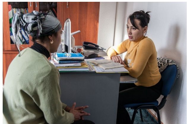
A resident of Khujand in northern Tajikistan receives free legal advisement.

Helvetas supports the transition to state-provided legal counselling and helps civil society organizations monitor service quality. We also strengthen the capacities of state actors to conduct legal awareness campaigns by developing communication strategies and informational materials.