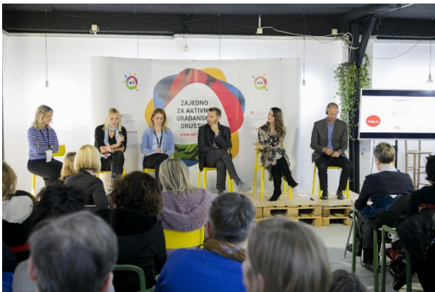
A panel discussion about the essential role of civil society organizations in Serbia.

The quality of democratic governance is steadily declining in Serbia and the space for civic engagement is shrinking. The program For an Active Civil Society Together (ACT) supports civil society organizations across the country to increase the trust and participation of citizens in decision-making processes, especially at the local level.