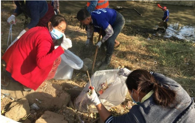
Civil society organizations, community members, businesses and government work together to rehabilitate a canal.

Through the Promoting Equitable, Accountable, Civic Engagement (PEACE) project's support, local civil society organizations expanded, strengthened, and developed more meaningful relationships with different levels of government and communities.