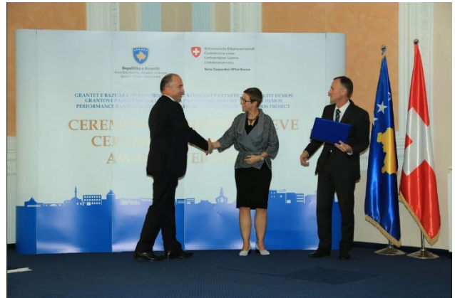
DEMOS annually awards grants to municipalities based on their performance.

The Decentralisation and Municipal Support (DEMOS) project helps municipalities through performance grants that are co-funded by the Kosovo government. Competition among municipalities, combined with technical assistance, triggers positive behavioral changes in the areas of improved democratic governance, financial and human resource management, and responsive public services.